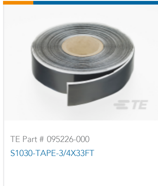
TE Part # 095226-000 S1030-TAPE-3/4X33FT